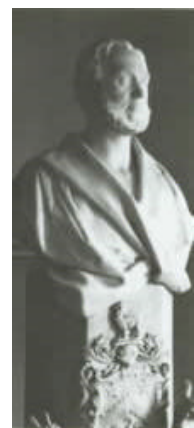
The marble bust of Titus commissioned and paid for by his workers

On September 9th 1869 The Prime Minister, Mr Gladstone wrote to Titus to inform him that her