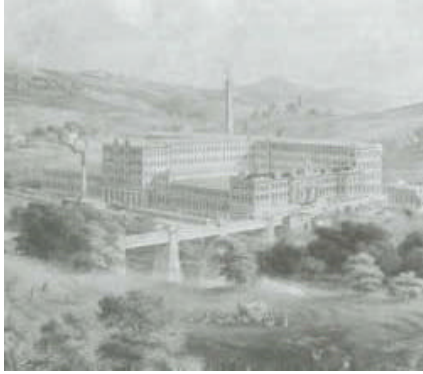
Saltaire Mill Shortly After Construction.

The site, which Titus had already acquired, was in open countryside next to the river Aire, the Leeds-Liverpool canal and soon the railway. Titus named the mill Saltaire. Built between 1851 and 1853 Saltaire mill was the marvel of its age. Local Yorkshire stone was used to build the mill which was in an Italianate style. Six stories high it had floor space of over 800,000 square feet. Over 3,200 people worked in the mill; the weaving shed housed 1,200 looms and produced 18 miles of alpaca fabric each day. Which as someone noted at the time "is almost 6,000 miles each year, which as the crow flies would reach over land and sea to Peru and the native mountains of the alpaca".