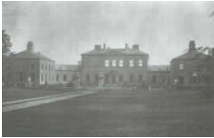
Crow Nest Where Titus Lived With His Family

When the manufacturer or merchant receives the goods duly dyed and finished, they are measured, made up and folded in paper ready for delivery to the draper or for export."