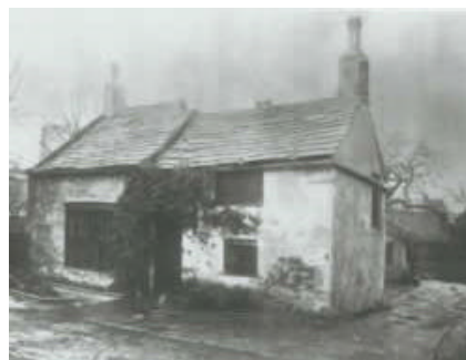
The Old Manor House, Where Titus Was Born

In 1813, Titus's father Daniel decided to speculate in food, as prices were high owing to the demand caused by the Napoleonic wars. As a result the family moved from Morley to a farm at Crofton near Wakefield. Titus and his sister Sarah were sent to a good school and rode there each day on a donkey, which was stabled at the Nag's Head public house.